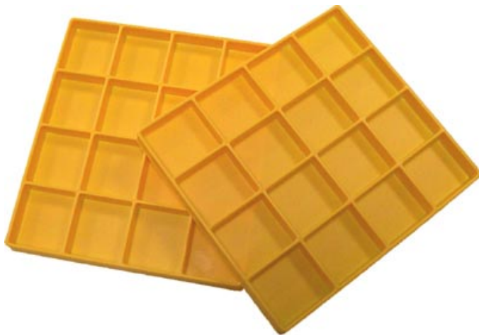
Vacuum formed IDP tray sample